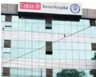
Ujala Cygnus Nangloi