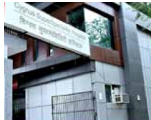
Ujala Cygnus Rewari