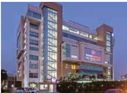
Aakash Healthcare, New Delhi