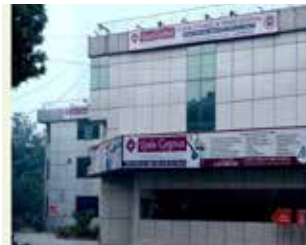
Ujala Cygnus Sonapat