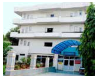
Ujala Cygnus Kanpur