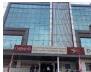
Ujala Cygnus Rama Vihar