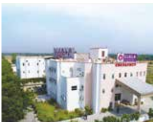
Ujala Cygnus Kashipur - Unit 1