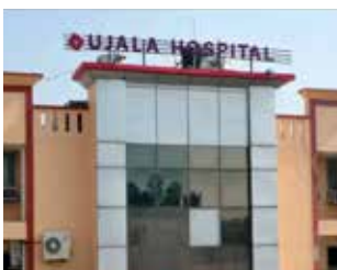
Ujala Cygnus Kashipur Unit 2