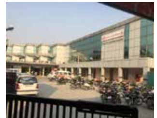
Ujala Cygnus Panipat