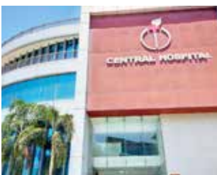
Ujala Cygnus Hospital Haldwani