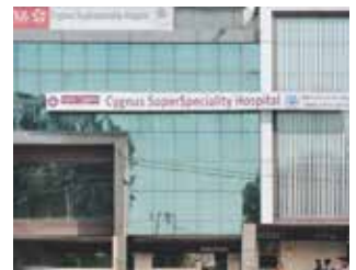
Ujala Cygnus Hospital Kurukshetra