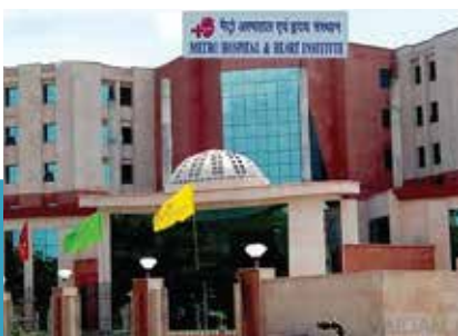
Metro Hospital, Noida