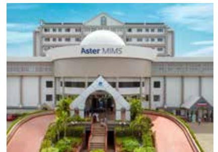
Aster Calicut (Launched Dec. 2021)