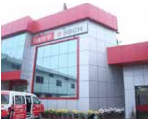
Ujala Cygnus Karnal