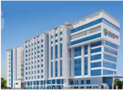
Kingsway Hospitals, Nagpur