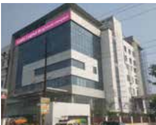
Ujala Cygnus Brightstar, Moradabad