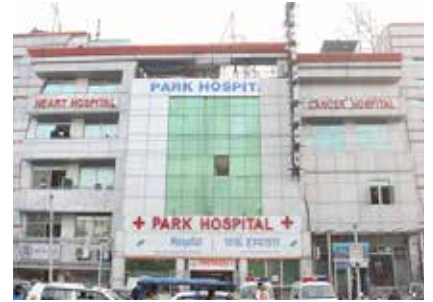
Park Hospital, Gurgaon