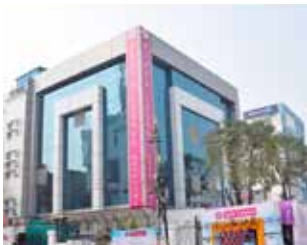
Ujala Cygnus Varanasi