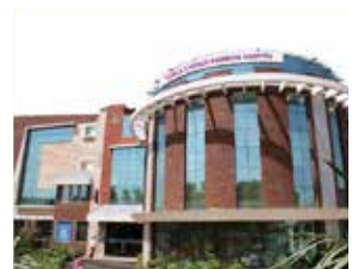
Ujala Cygnus Rainbow Hospital, Agra