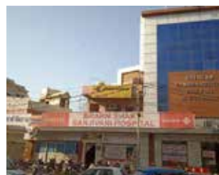
Ujala Cygnus Magnus Brahm Shakti Sanjivani